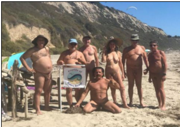
After the Beach Cleanup, a few of the volunteers enjoyed a clothing-optional picnic at Bates Beach, Santa Barbara County.