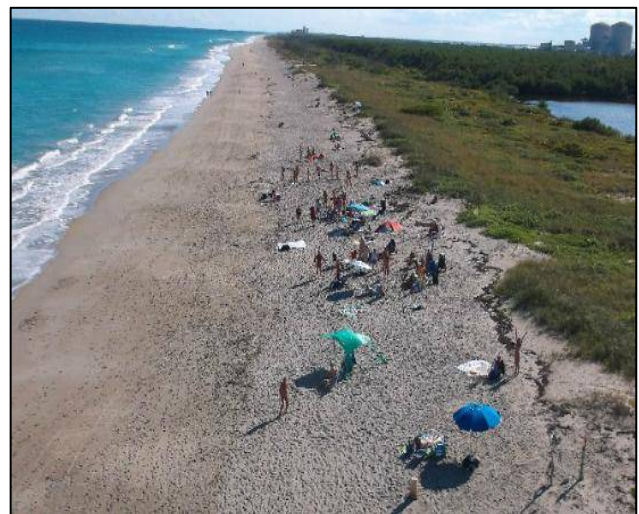
Aerial view of Blind Creek Beach on Hutchinson Island near St Lucie, Florida

It was further pointed out by a government official that “Florida has over 860 miles of sandy beaches, Certainly, a few miles dedicated here and there for naturist beaches won't deny anyone of a beach to visit.”