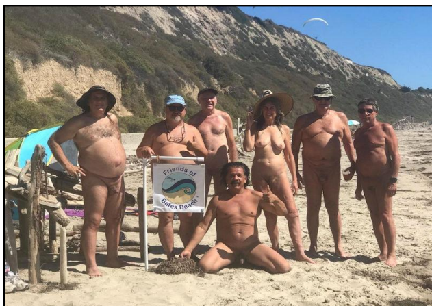
After the Beach Cleanup, a few of the volunteers enjoyed a clothing-optional picnic at Bates Beach, Santa Barbara County.